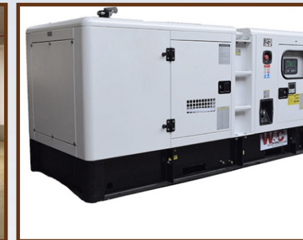
24 x7 Generator