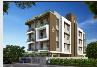
Ashiana Pride - Patna