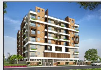
Dwarkapuri - Khagaul Road