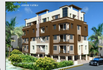
Ashok Vatika-Dav Khagaul